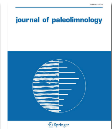
Journal of Paleolimnology